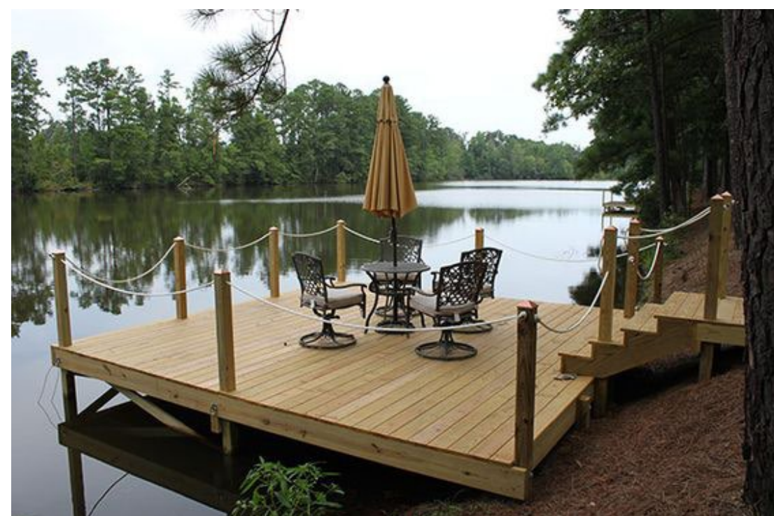
Creek Access + Steps + Deck

Daylighting Lick Creek is a creative way to utilize an existing natural asset in a way that creates a new attraction to Dante's downtown. Community members get a unique perspective of the creek with a viewing platform, accessed by steps or an ADA ramp, while a pedestrian bridge and crosswalk connects the park (right) to Lower Bearwallow Road (left). A half-court basketball area and picnic shelter are two of several new destinations.