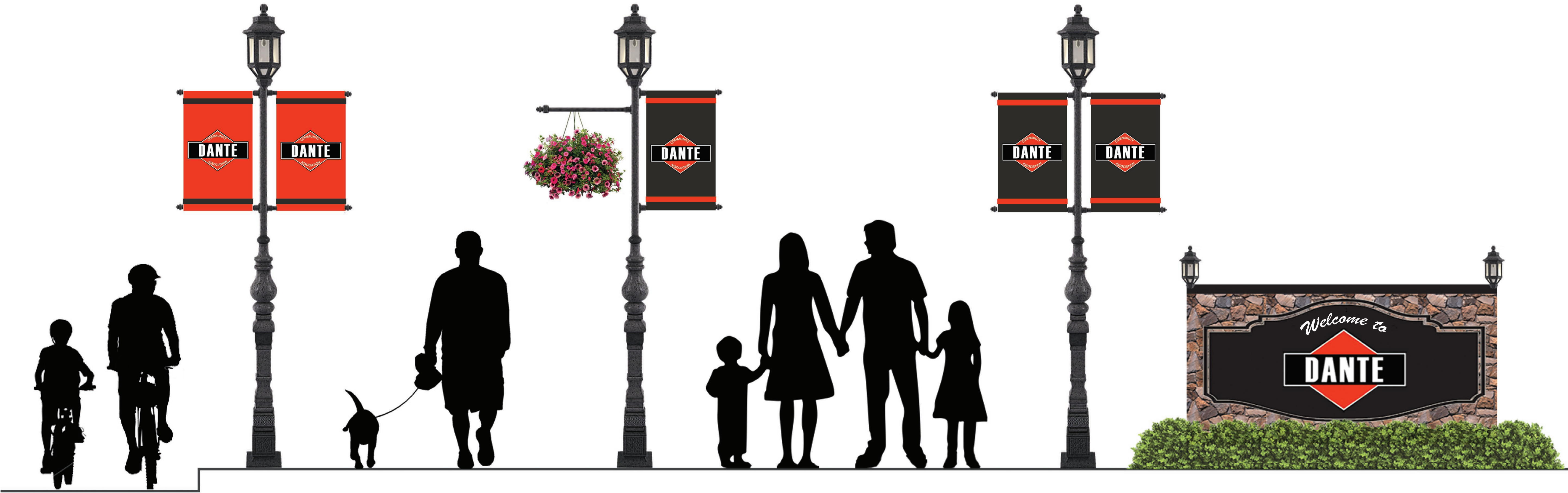
Wayfinding and Street Furnishings (left to right): Pedestrian-scale street lamp (12' tall) with double hanging banners (orange), street lamp with hanging banner and flower basket combination option, street lamp with double hanging banners (black), town entry sign (4' tall) with attached lamps (stone, iron, and plantings)

Disclaimer : This drawing is conceptual and was prepared to show approximate location and arrangement of site features. It is subject to change and is not intended to replace the use of construction documents. The client should consult appropriate professionals before any construction or site work is undertaken. The Community Design Assistance Center is not responsible for the inappropriate use of this drawing.