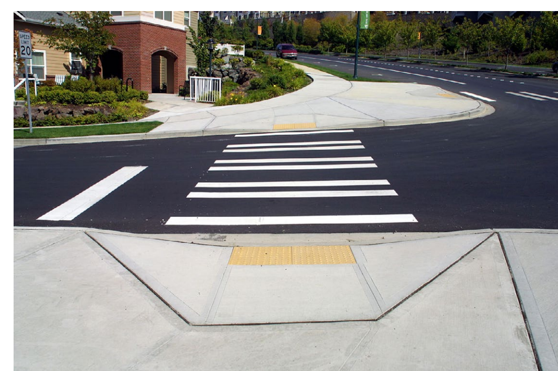
ADA Sidewalk & Pedestrian Crossing