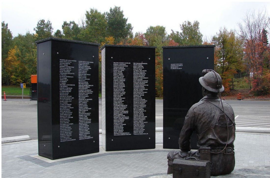
Relocated Memorial with proposed Statue