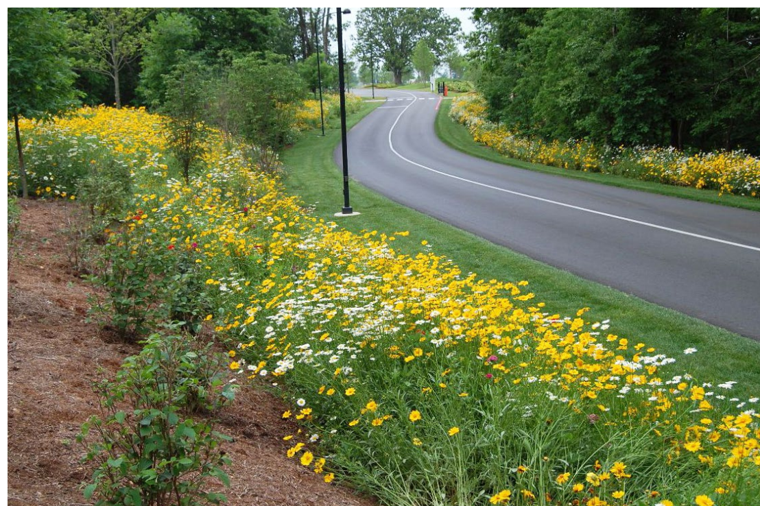
Wildflower Planting Along Entry Road