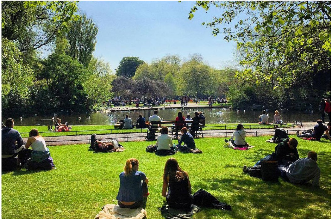
Open Lawn + Social Gathering