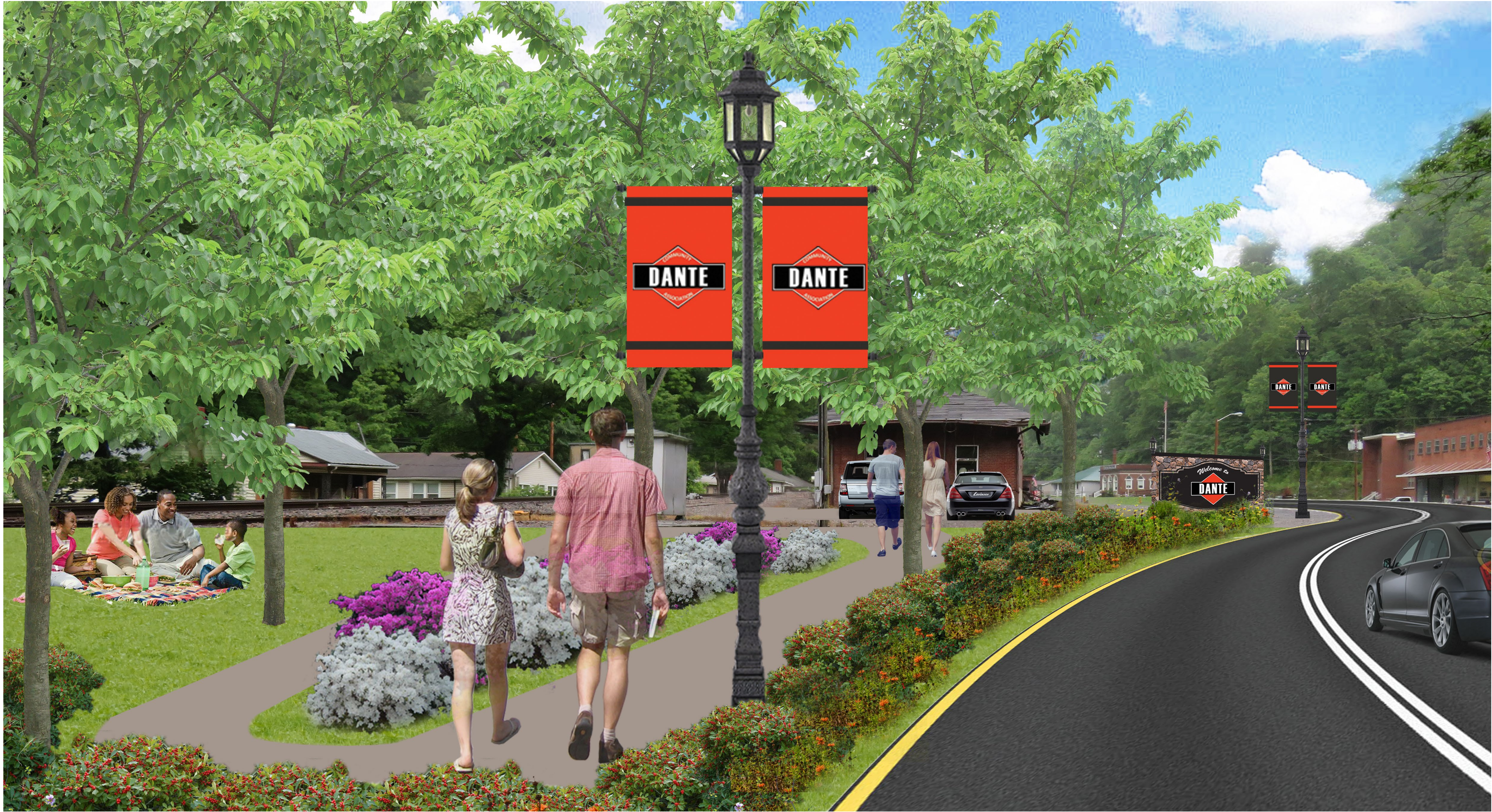
The entry park provides a welcoming introduction to Dante with a stone welcome sign, street lighting with hanging community banners, renovated depot and parking, and a walking trail that connects pedestrians to other parts of the downtown.