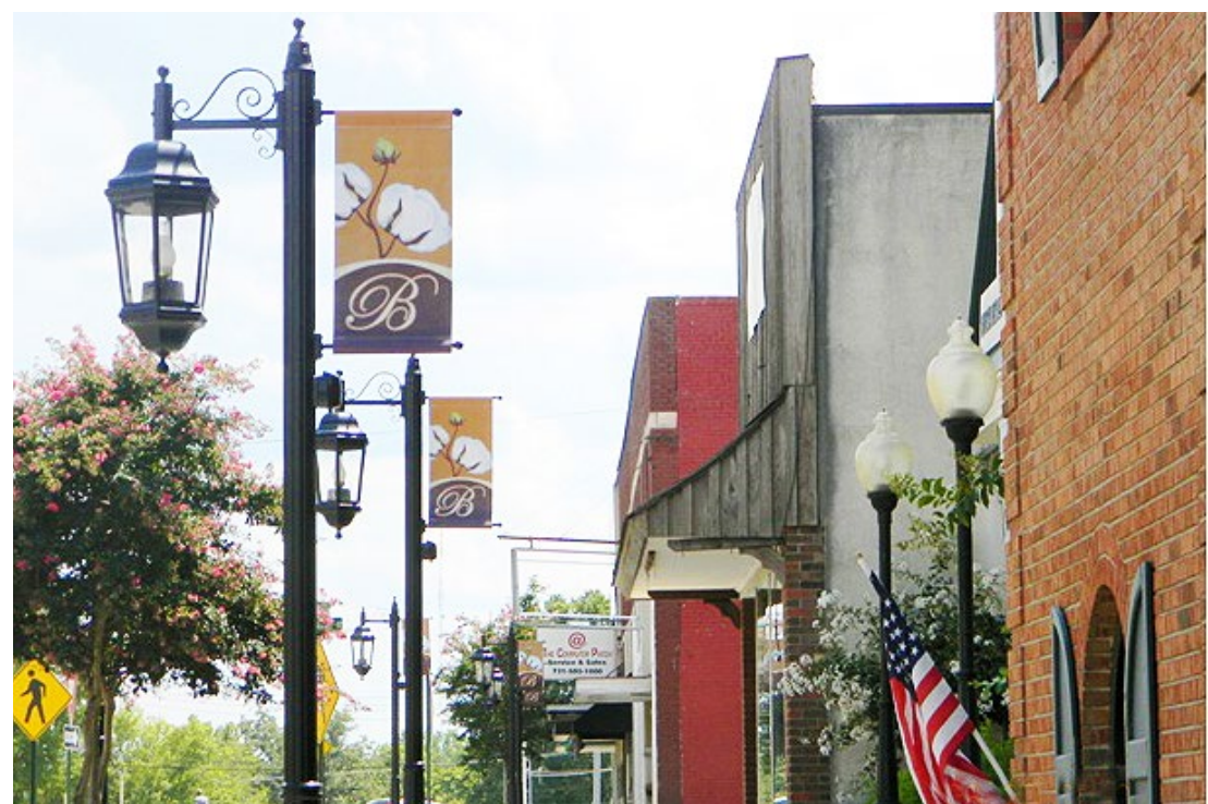
Street lamp + banner combination