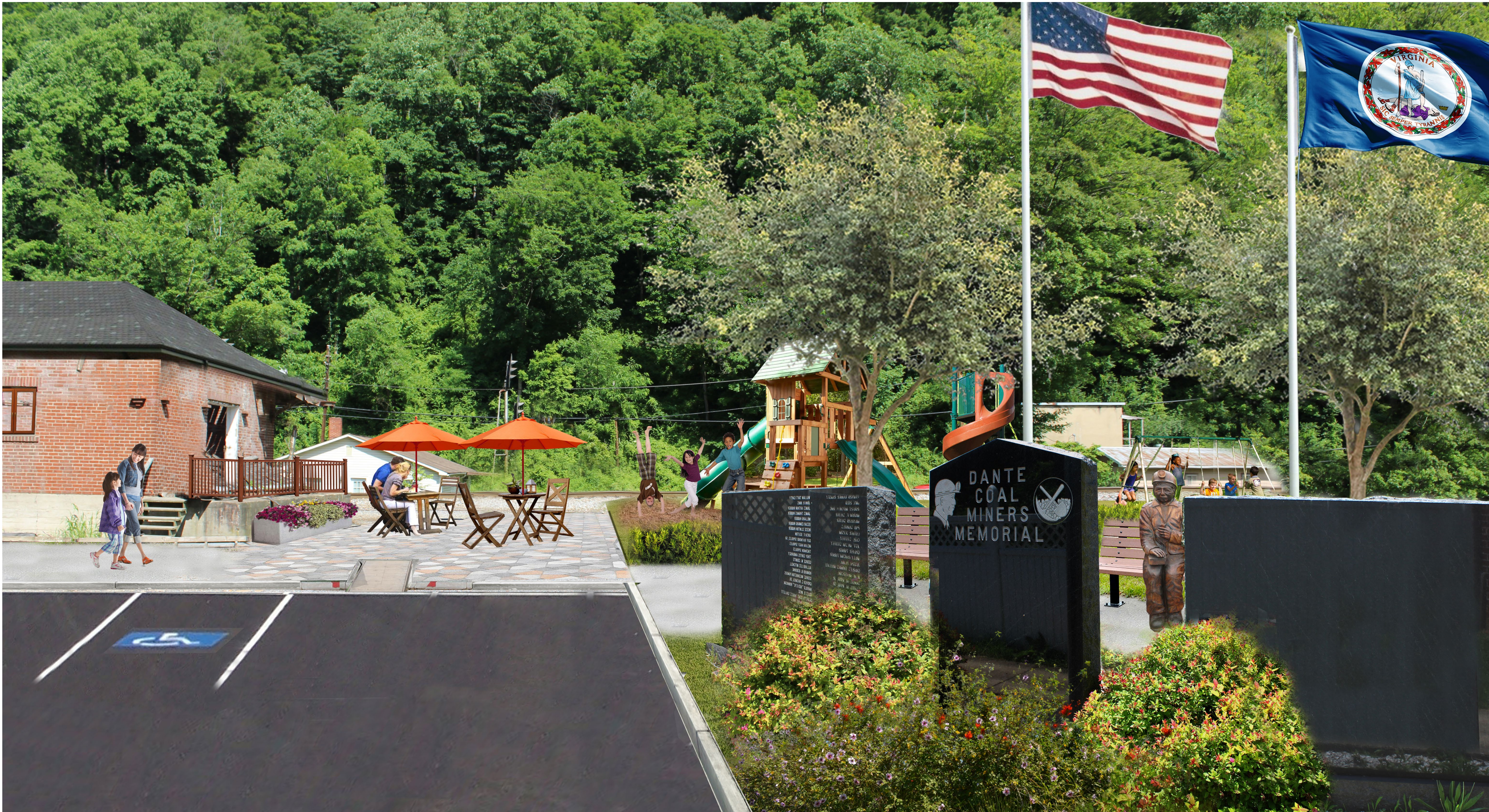
Outdoor seating, a multi-age playground and relocated Coal Miners Memorial (moved from its current location at the Dante Volunteer Fire Department) anchor the south portion of the park. A sitting coal miner statue provides a unique addition to the Town’s current memorial that is both commemorative yet interactive and playful as people visit the park daily.