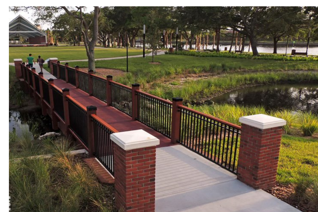
Pedestrian Bridge over Creek