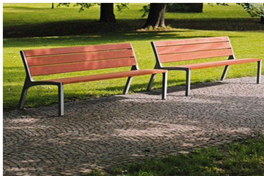
Park Bench Along Pathway