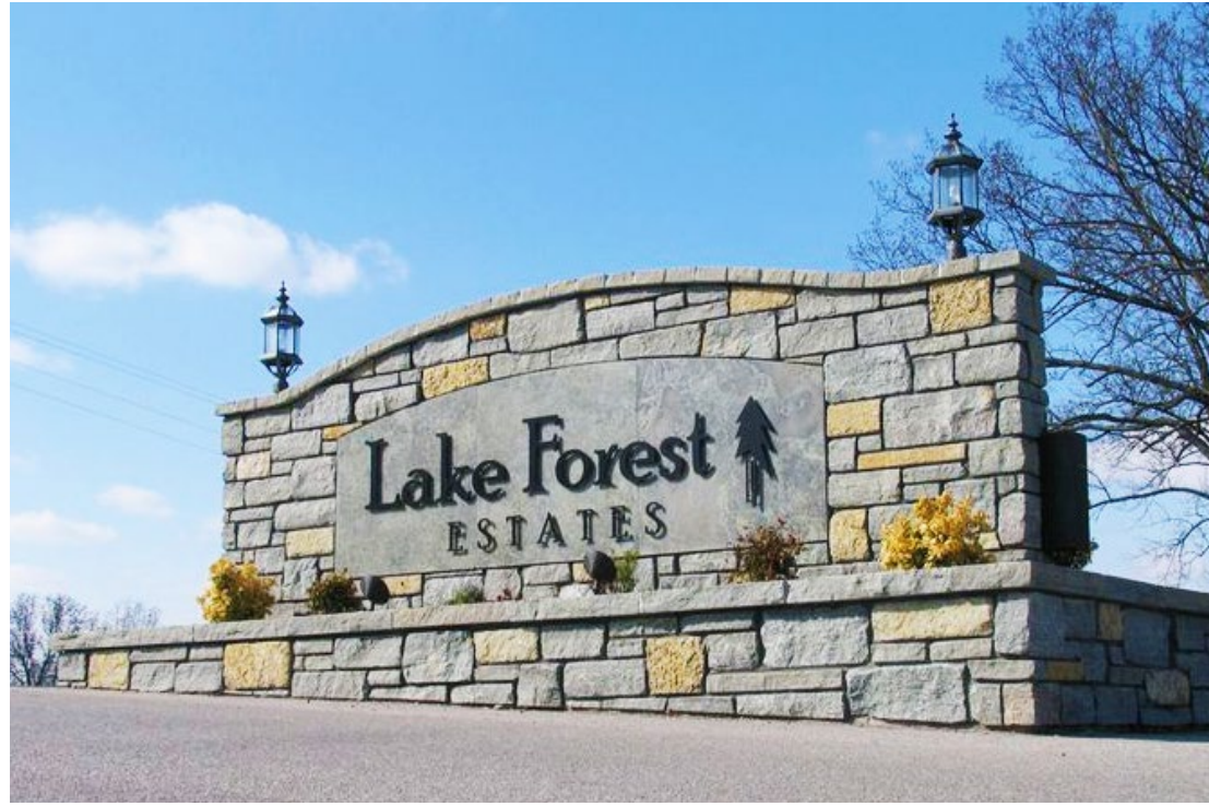
Entry sign with attached lamps